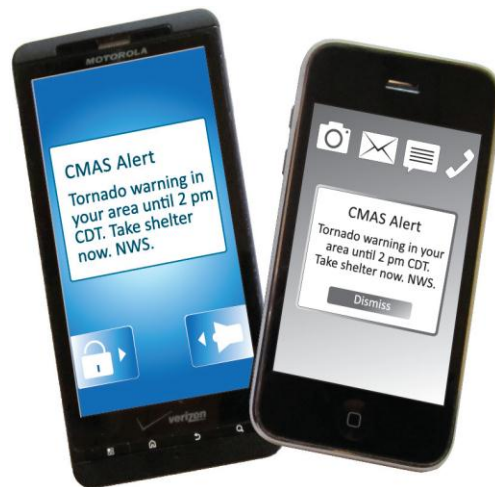
Illustration only. Actual message appearance will vary.